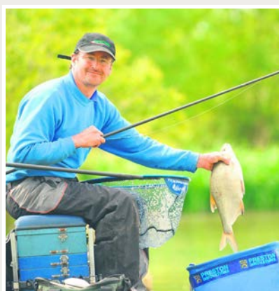
Bag up on skimmers at Churchgate Lakes, in Essex.

HOW TO TAKE PART – Cut out the special voucher below, take it to one of the participating fisheries listed in our 2-for-1 scheme and you'll receive two day tickets for the price of one. Enjoy!