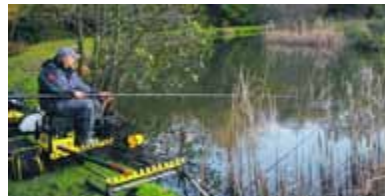
Tanyards holds perch to 3lb in its Carp Free Pool.