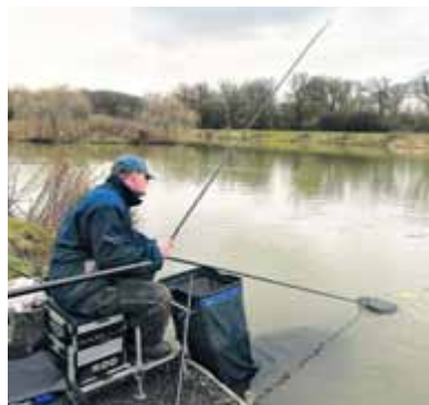
Lake John produces perch to 3lb in the winter.