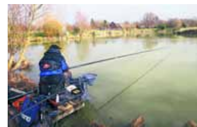
Chestnut Pool in Biggleswade is hot for perch.