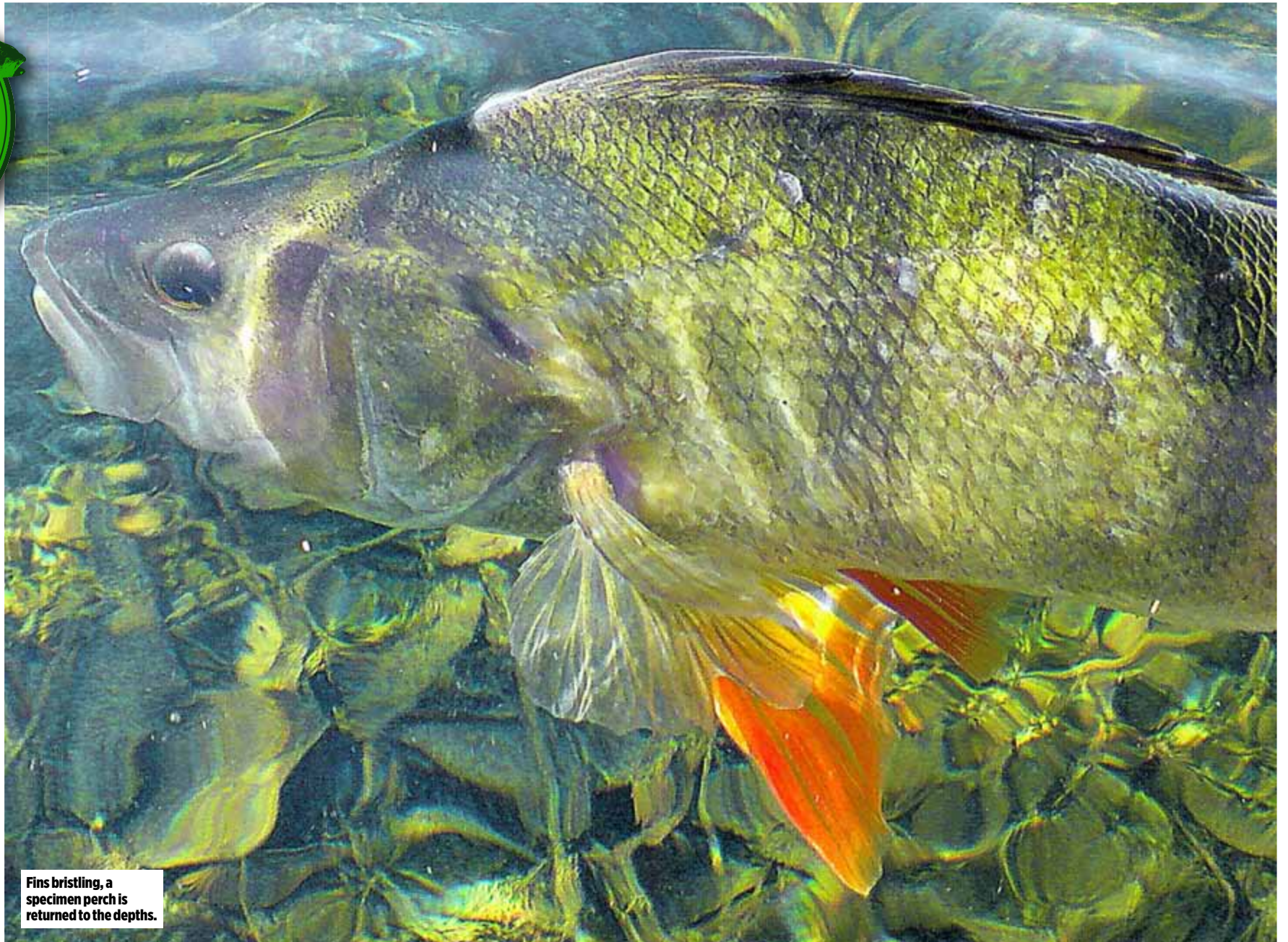
Fins bristling, a specimen perch is returned to the depths.